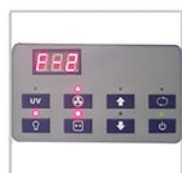
LED Display Digital LED display: Airflow Level