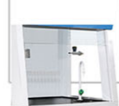
Back Side Air Compensation To avoid turbulence in work area