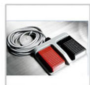
Foot Switch Use foot switch to adjust the height of front window.