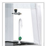
Water & Gas Tap Water Sink